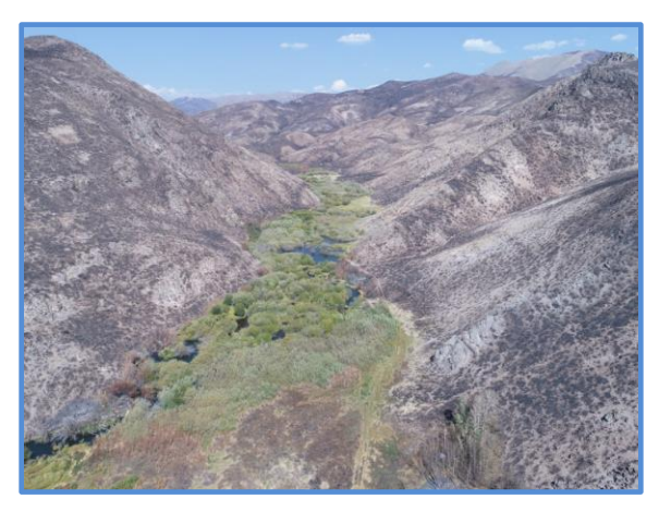
Beaver ponds and wetlands provide fire breaks and wildlife and livestock safe zones and habitat during and after a wildfire. (Sharps Fire, Idaho)

Beaver and other wildlife on federally-managed public lands (FMPL) in Oregon are primarily managed by the state through Oregon Department of Fish and Wildlife (ODFW). Current furbearer regulations allow for recreational and commercial beaver trapping and hunting during the breeding/pregnancy season, and since beaver kits stay with the adults for up to two years, a whole colony can be removed in a single season. From 2000 to 2018, over 58,000 beaver kills were reported to the State.